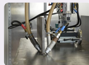
Modified mounting of the hinged arms

Flux recovery unit Rails Special design for cored wire